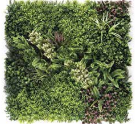
TROPICAL MEADOW 100X100CM OD K001C-$95