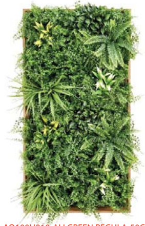
OD-AO100H010-ALLGREEN REGULA-50C X 100CM $130