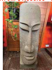
TOPENG 110CM $250.00