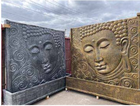
BUDDHA FACE 2M W/F, PUMP $1,950.00/EA