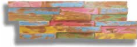
(RB-003) COLORFUL RAINBOW