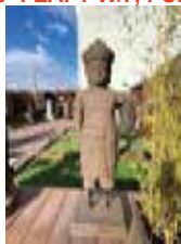
SOLDIER ON STAND 108CM $250.00