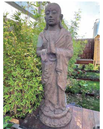
STADING BUDDHA 140CM, $350.00