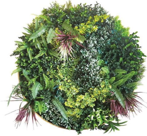
OD-KOO3CV031-BLOOMING SPHERE-DIA 100CM $250