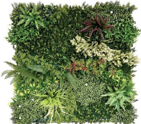
OD-KOO3A-SPRING MEADOW- 100MMX100MM $95