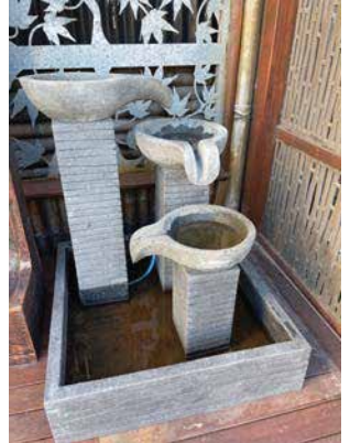
ZEN CIRCA W/F H=1.5M, PUMP $1,250.00 ECLIPSE W/F , H= 1.6M, PUMP $1,250.00 STRING WF, H=1.5M, PUMP $1,250.00 TRIO BOWL W/F, H= 90CM $950.00/EA