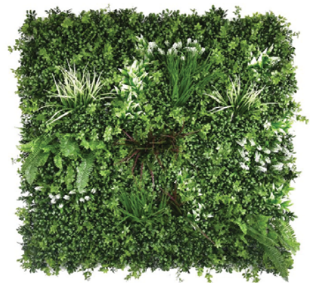
OD-FOO1 -WHITE SUMMER-100CM X 100CM $95