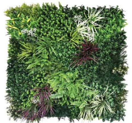
OD-AO148- ELEGANT SPRING- 100CM X 100CM $95