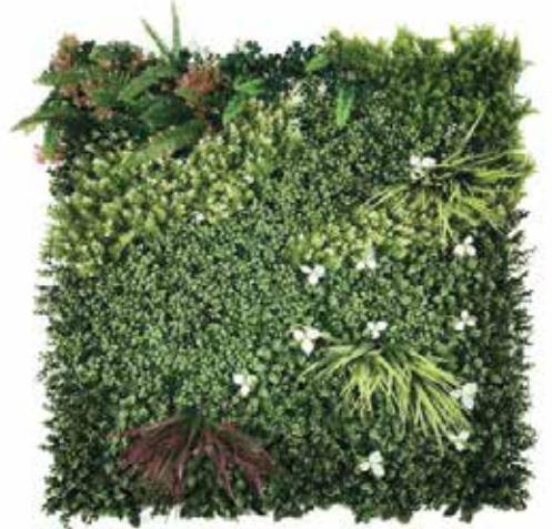
AUTUMN BLOSSOM 100X100CM OD A076 - $80