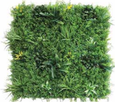
MISTY RAINFOREST O 100X100CM D-A100 $95