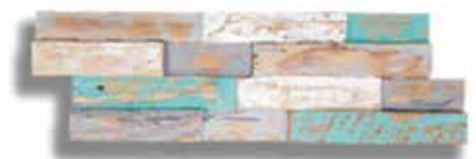
(RB-002) NAVY RAINBOW