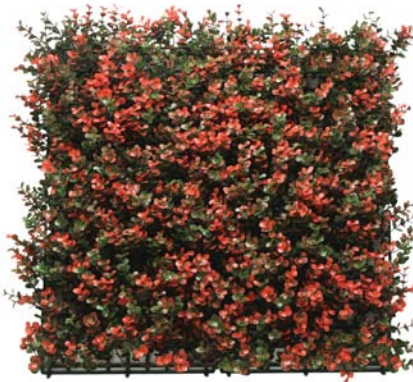
LUCKY STYLE OD A013- 50X50CM.JPG $15