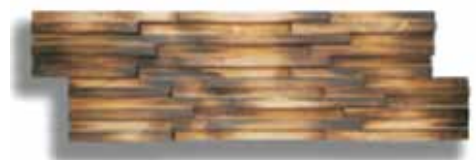
(RL-002) RUSTIC RIPPLE