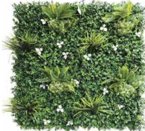
ELEGANT WHITE 100X100CM OD A108 - $80