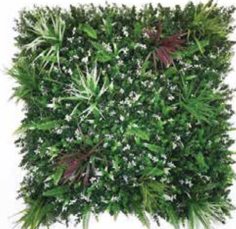
WHITE SPRING 100X100CM OD A075 - $80