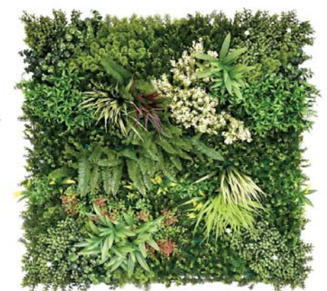
OD-KOO3C- SPRING MEADOW-100MMX100MM $95