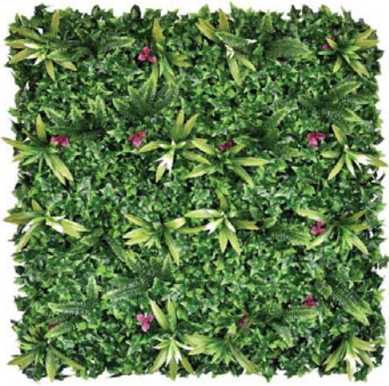
OD-AO1335 - ELEGANT FOREST-100CM X 100CM $80