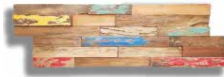
(CR-005) VINTAGE CORAL