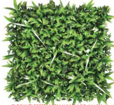
ELEGANT GREEN 50CM X 50CM OD A017-$15