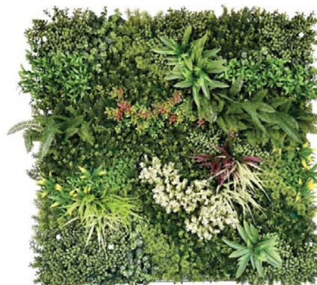
OD-KOO3B-SPRING MEADOW- 100MMX100MM $95