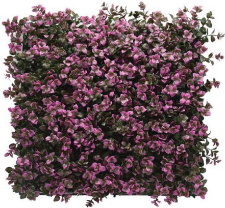
OD-AO74V204-BLOOMING SQUARE-100CM X 100CM $250