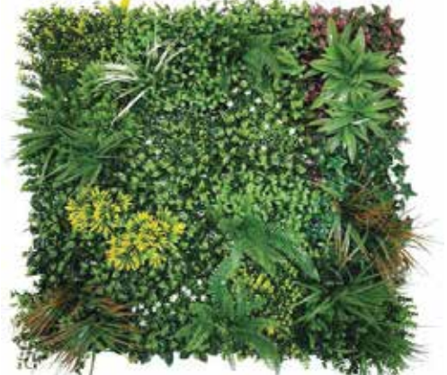
TROPICAL MIST 100X100CM OD A109 - $80