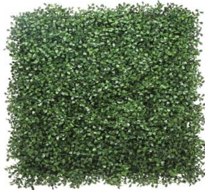
OD-A0001 -EVERSOFT GREEN 50CM X 50CM $15