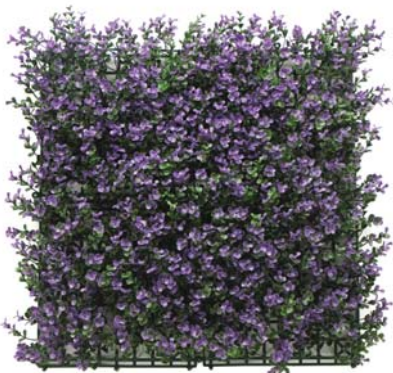
SHADOW WALL OD011- 50X50CM $15