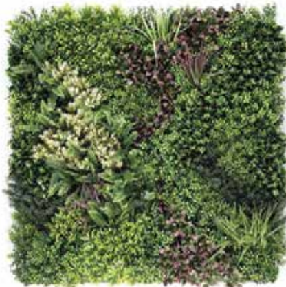
TROPICAL MEADOW 100X100CM ODK001A-$95