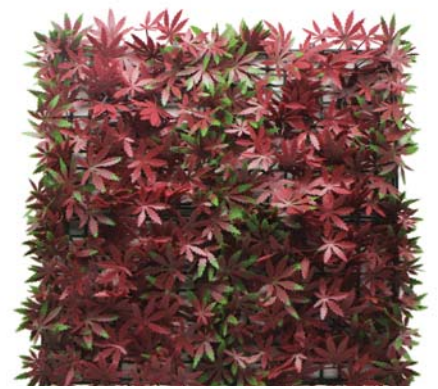
COZY AUTUMN OD A007- 50X50CM $15