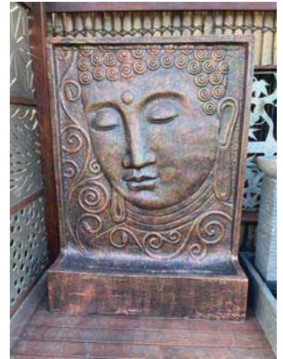
PYRAMID W/F, PUMP, H=1.25M $1,250.00 WAVE W/F, PUMP, H=1.65M $950.00 FEAFY W/F, PUMP, H=1.70M $1,550.00 BUDDHA FACE W/F, PUMP, H=1.55M $1,250.0