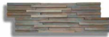
(RL-007) GREY WASHED RIPPLE