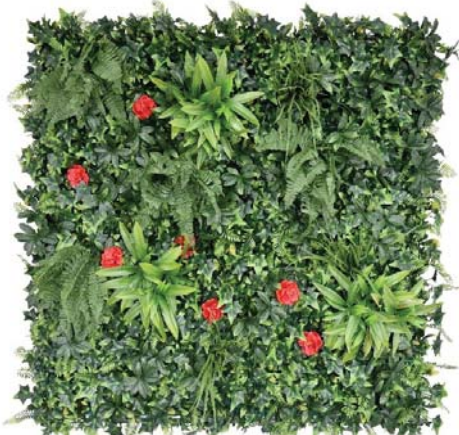
OD-FO20 - WINTER BLOSSOM -100CM X 100CM $80