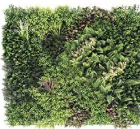
TROPICAL MEADOW 100X100CM ODK001B-$95