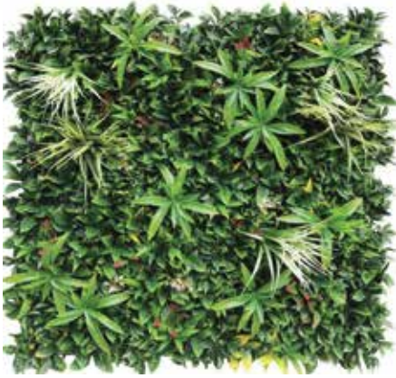
MISTIQUE GREEN CLIFF 100X100CM OD A104 - $80