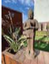
STAANDING BUHDA 140CM $250.00