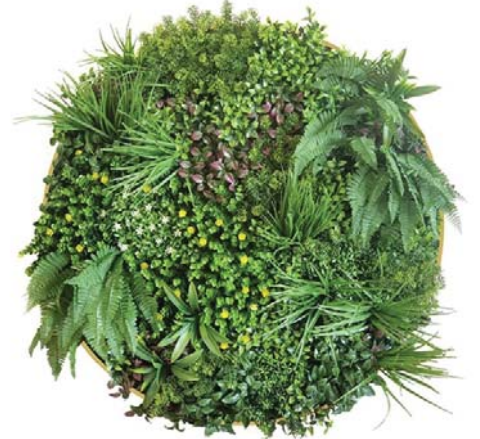
OD-FOO6VO31-WONDERLAND SPHERE-DIA 100CM $250