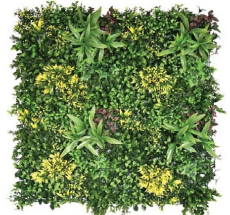
OD-AO136-TROPICAL JOY- 100CM X 100CM $80