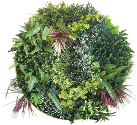
OD-FO31VO33- JOYFULL SPHERE-DIA 100CM $250