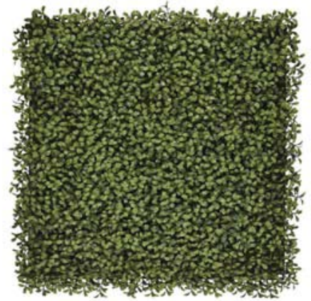
OD-A0019-WINTER GREEN 50CM X 50CM $15