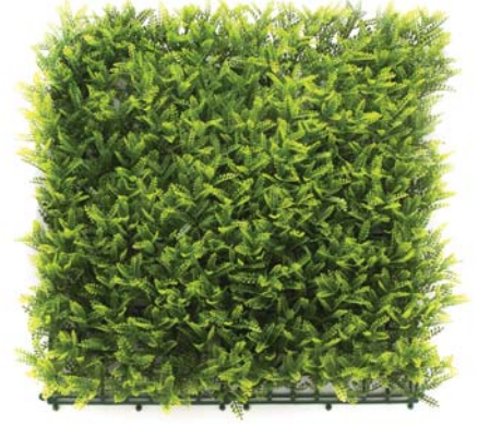
GREEN MIST OD A030 -50X50CM $15