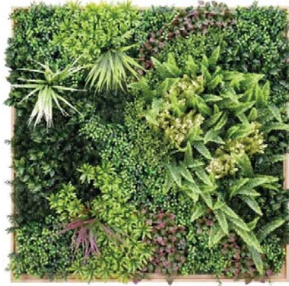
OD-KOO1BVO14 -EVERLASTING SQUARE-100CMX100CM $250