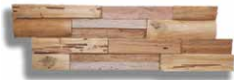
(CR-007) BIG CORAL

PRICE INCLUDED GST SPECIAL WHILE STOCK LAST LMT: LINEAR METTER PRICE CORRECT AS AT 01-06-2024