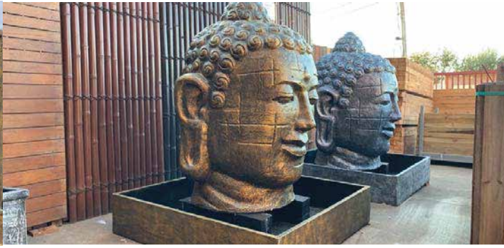
BUDHA HEAD W/F, H=1.7M , PUMP$950.00/EA