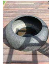
OVAL POT 90CM, $350.00