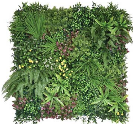
OD-FOO6 -MAGIC AUTUMN- 100CM X 100CM $95