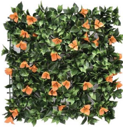
OD-AO211-BOUGAINVELLIA- 50CM X 50CM $15