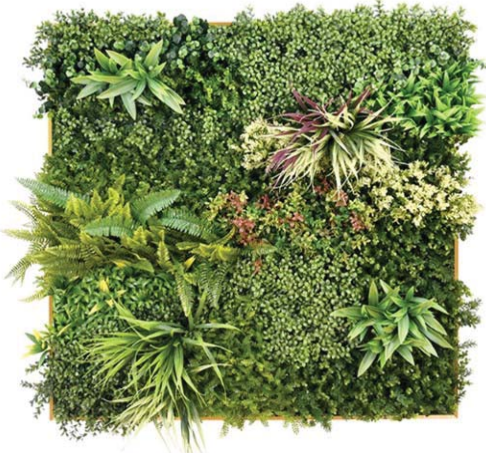
OD-AO74V204-BLOOMING SQUARE-100CM X 100CM $250