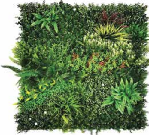
SUMMER MEADOW 100x100CM OD A074 - $80