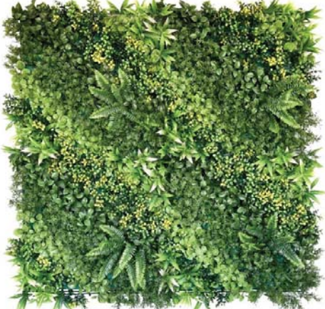
OD-AO134S -SHADY GARDEN -100CM X 100CM $80